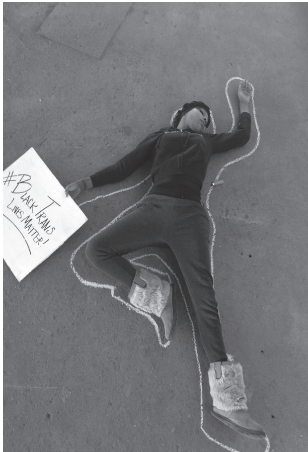
Member of BreakOUT!, a Resist grantee in New Orleans, Louisiana with a sign reading "#BlackTransLivesMatter."

Black Lives Matter is an ideological and political intervention in a world where Black lives are systematically and intentionally targeted for demise. It is an affirmation of Black folks' contributions to this society, our humanity, and our resilience in the face of deadly oppression.